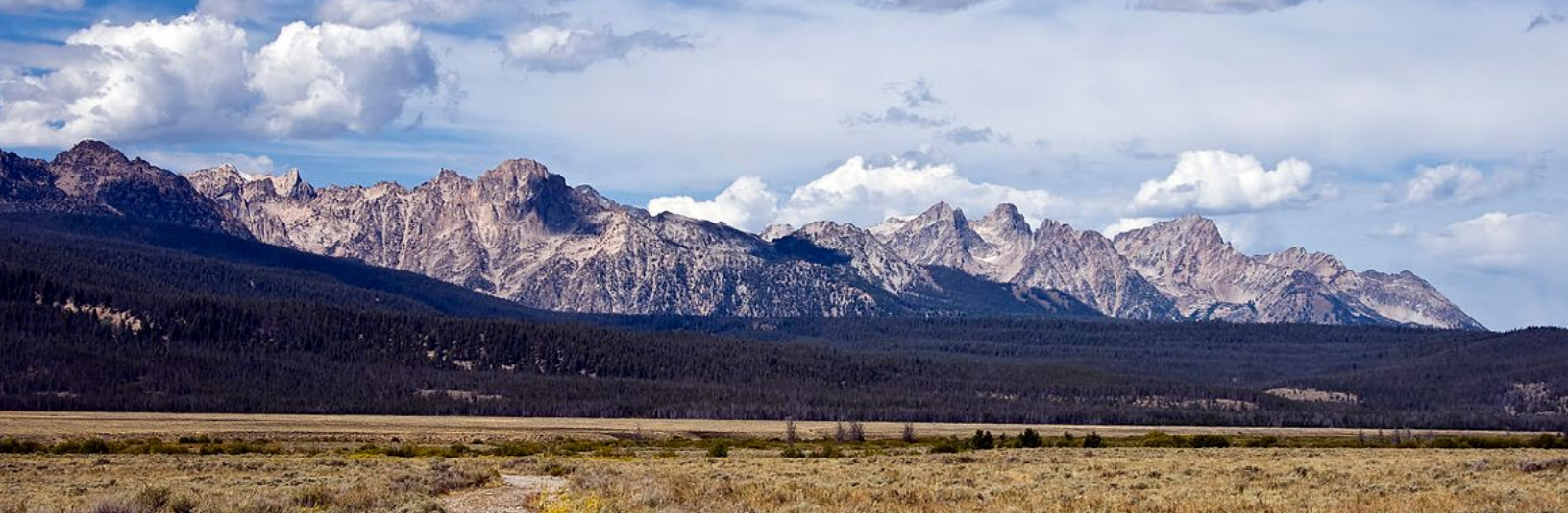
Sawtooth National Forest, Idaho