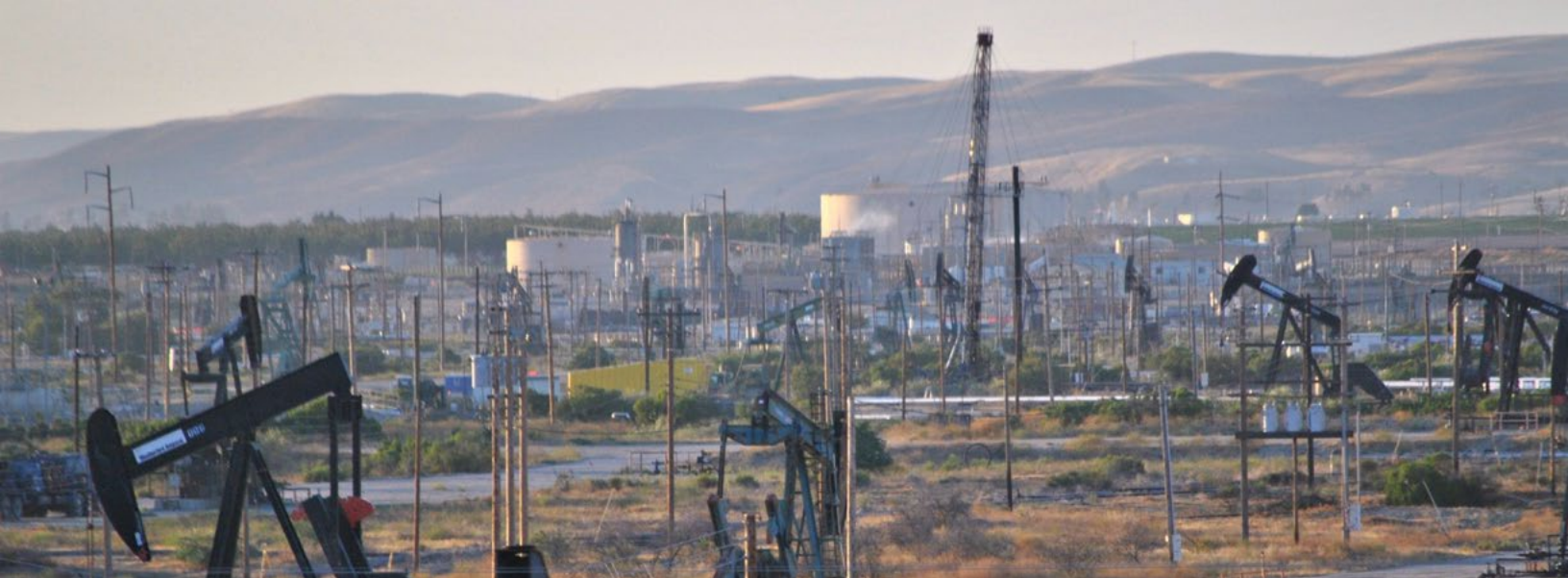
San Ardo oil field, California

Based on recent and historic polling, these federal lawmakers are out of touch with the majority of American voters, including those in their own states. Their radical anti-public lands agenda serves to benefit a few corporate and extractive interests over the greater, long-term good of millions of Americans who love public lands and the wildlife that depend on them. In a testament to public support for maintaining public lands, one week after Rep. Jason Chaffetz (R-Utah) reintroduced his bill to sell 3.3 million acres of public lands, Chaffetz withdrew his bill after massive public opposition. While that may have a chilling effect on overt land seizure, these public-lands enemies and their local allies have not been dissuaded from their goal of seizing control of public lands.